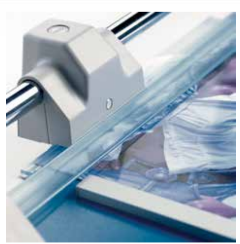
Automatic clamping on the cutting line for holding item being cut perfectly in place